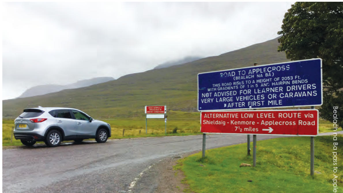
Bealach na Ba pass to Applecross